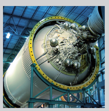
Research & Development